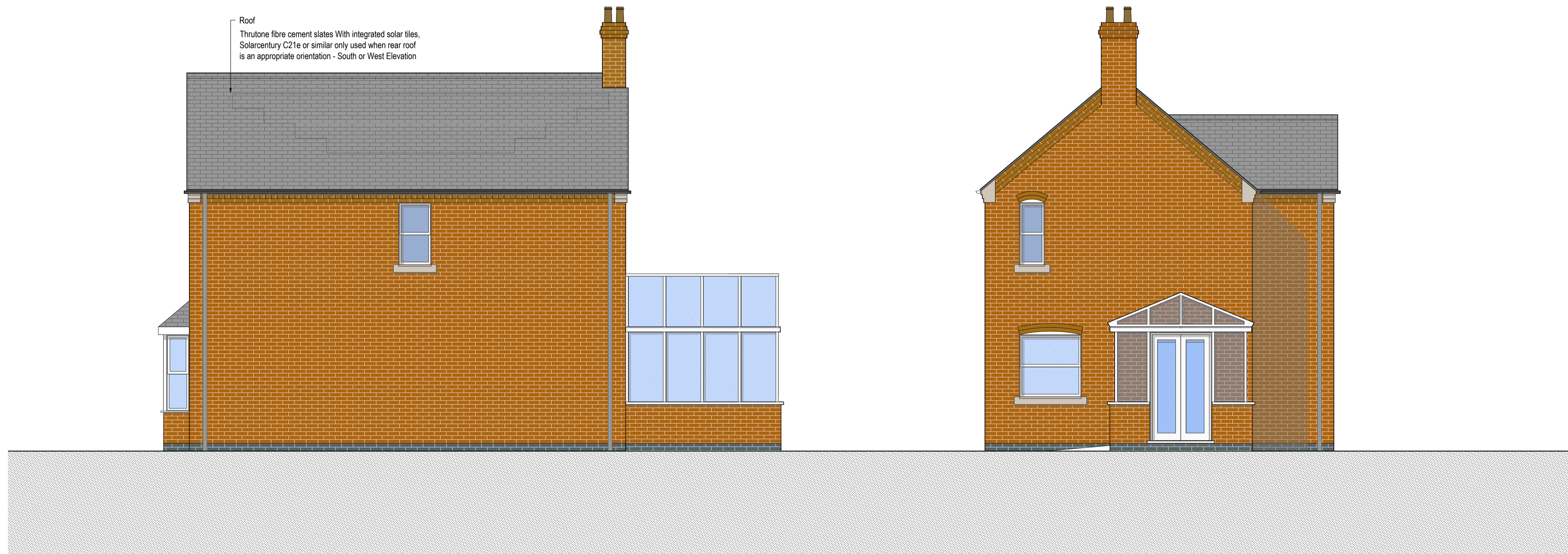
C Rear Elevation